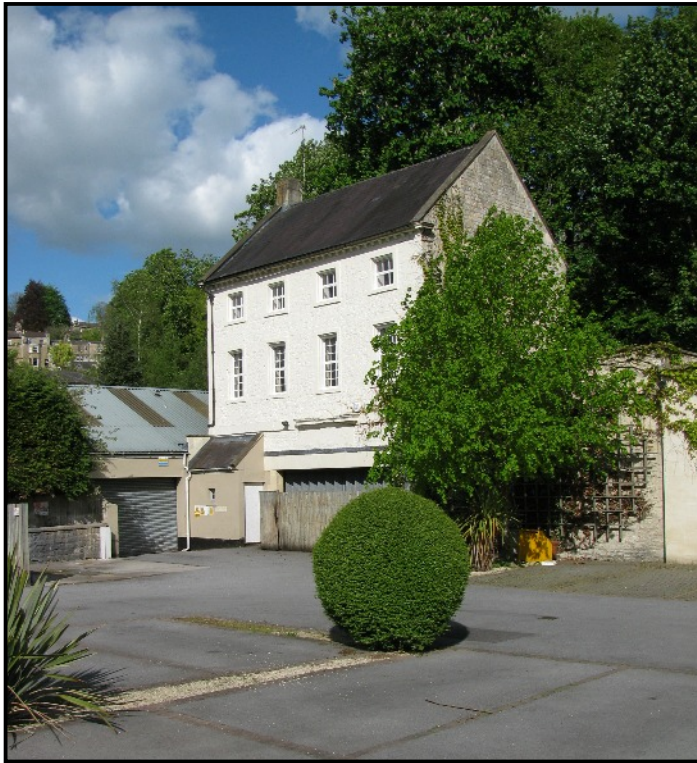
Widcombe Mill, Prior Park Road, see October meeting.

For further information about the Society's activities contact: