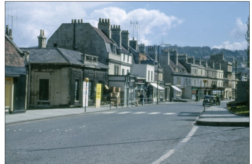
Southern Dispensary and Claverton Buildings, Widcombe, c.1960s. See May meeting