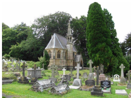
Eyre Chapel from the east