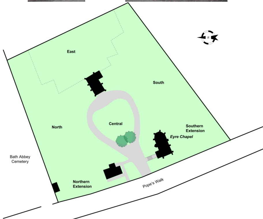
Arrangement of the cemetery