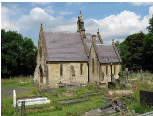
Mortuary Chapel from the south

A new chapel between St James Parade and Lower Borough Walls was due to be opened in 1780 but it was destroyed on 8 Jun 1780 during Bath's Gordon Riots. A chapel in Corn Street was used in the period 1786-1809 after which the former Theatre Royal in Old Orchard Street (also known as Pierrepont Place) was bought. The Theatre Royal had moved to its current site in 1805. The site in Old Orchard Street was converted into a church with a floor being built over the theatre's pit, giving a vaulted crypt which was used for burials. Rooms were also used for schools. The crypt was prone to flooding and, as a consequence, a new graveyard at Perrymead was opened in 1856. St John the Evangelist, South Parade was consecrated on 6 Oct 1863. The previous church became, and remains, the Masonic Hall.